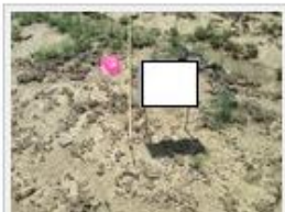
NW-SE, Close-up Review