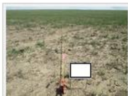
SW-NE, Televue Review