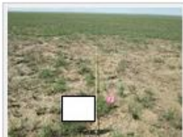
NE-SW, Televue Review