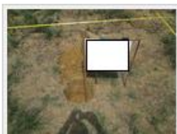
Other, Other Review