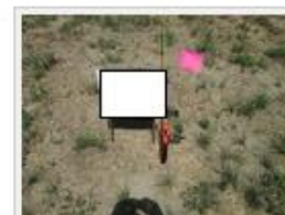
SE-NW, Close-up Review