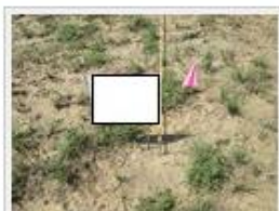
NE-SW, Close-up Review