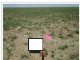
SE-NW, Televue Review