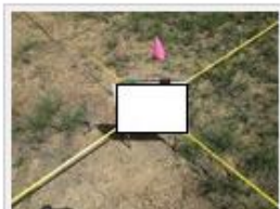
Other, Other Review