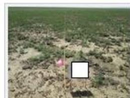
NW-SE, Televue Review