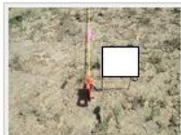
SW-NE, Close-up Review